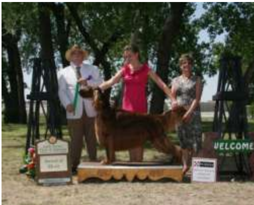
CH Cairncross Hits the High Note