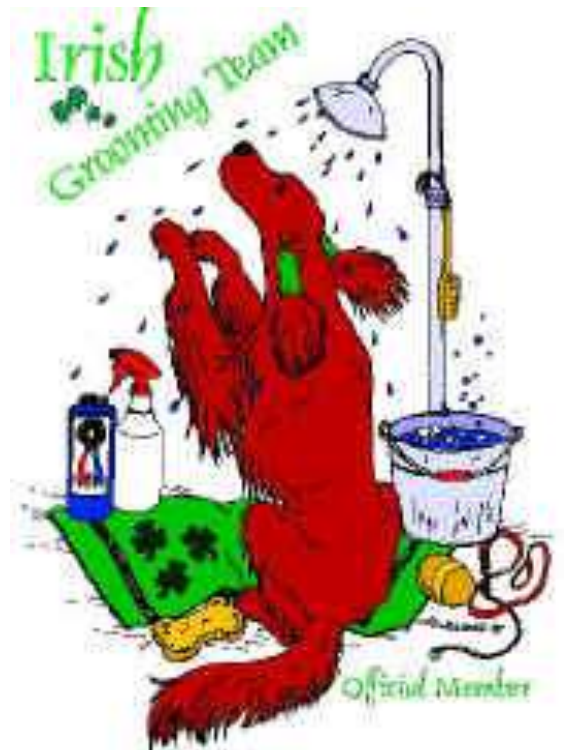
Getting ready for the National . . .